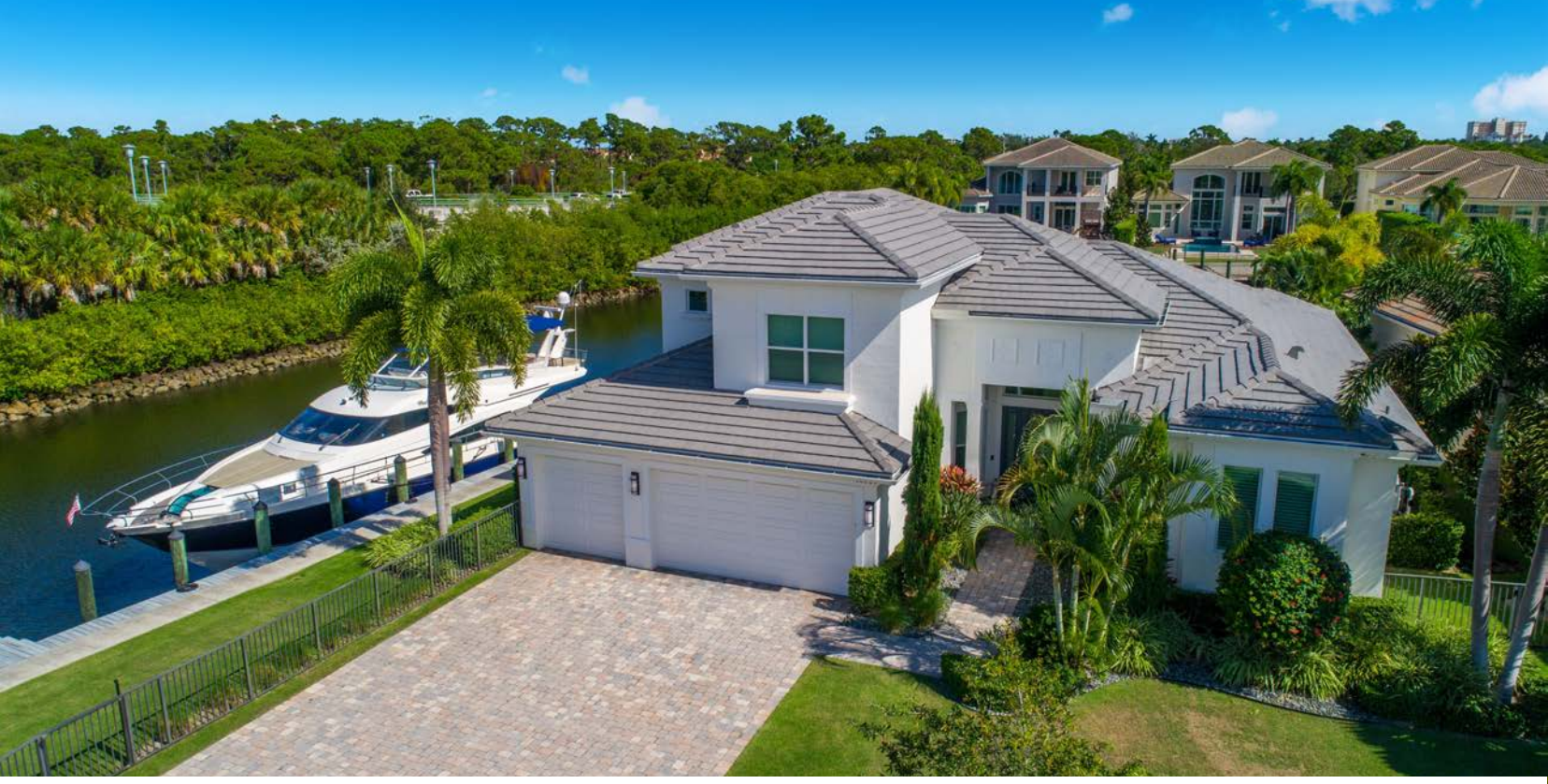
13966ChesterBay,com | Frenchman's Harbor | 4,138 AC sf | 4Bd.5.2Ba.3CG | $2.995M