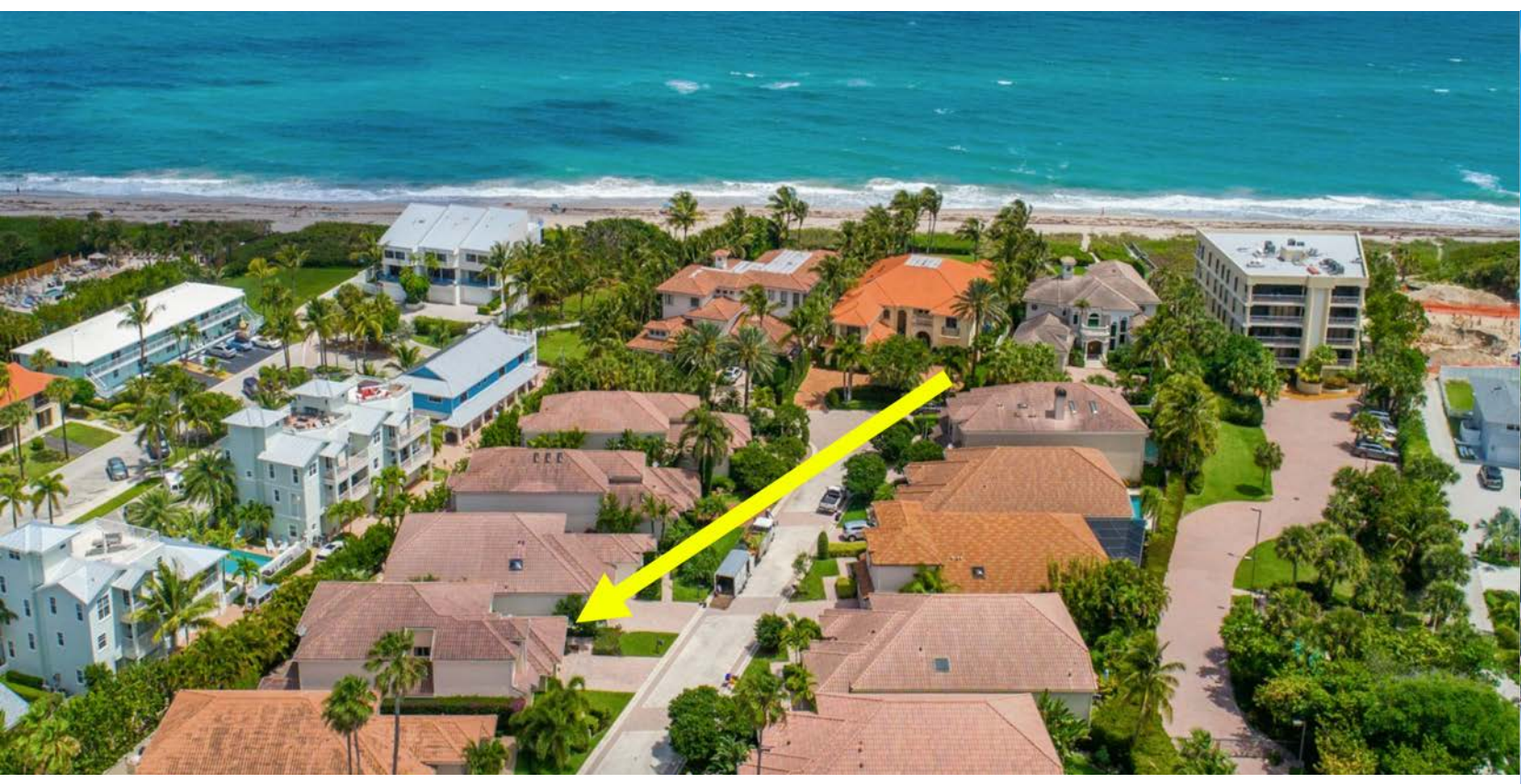
312Alicante.com | Alicante at Juno Beach | 3,191 AC sf | 5Bd.4.1Ba.2CG | $1.295M