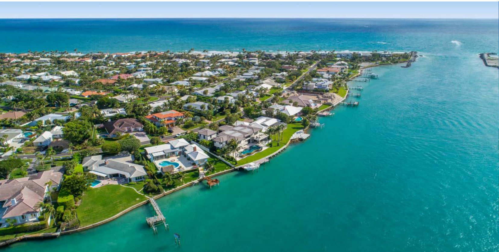
88Lighthouse.com | Jupiter Inlet Colony | Panoramic Direct Inlet & Intracoastal Views | $3.9M