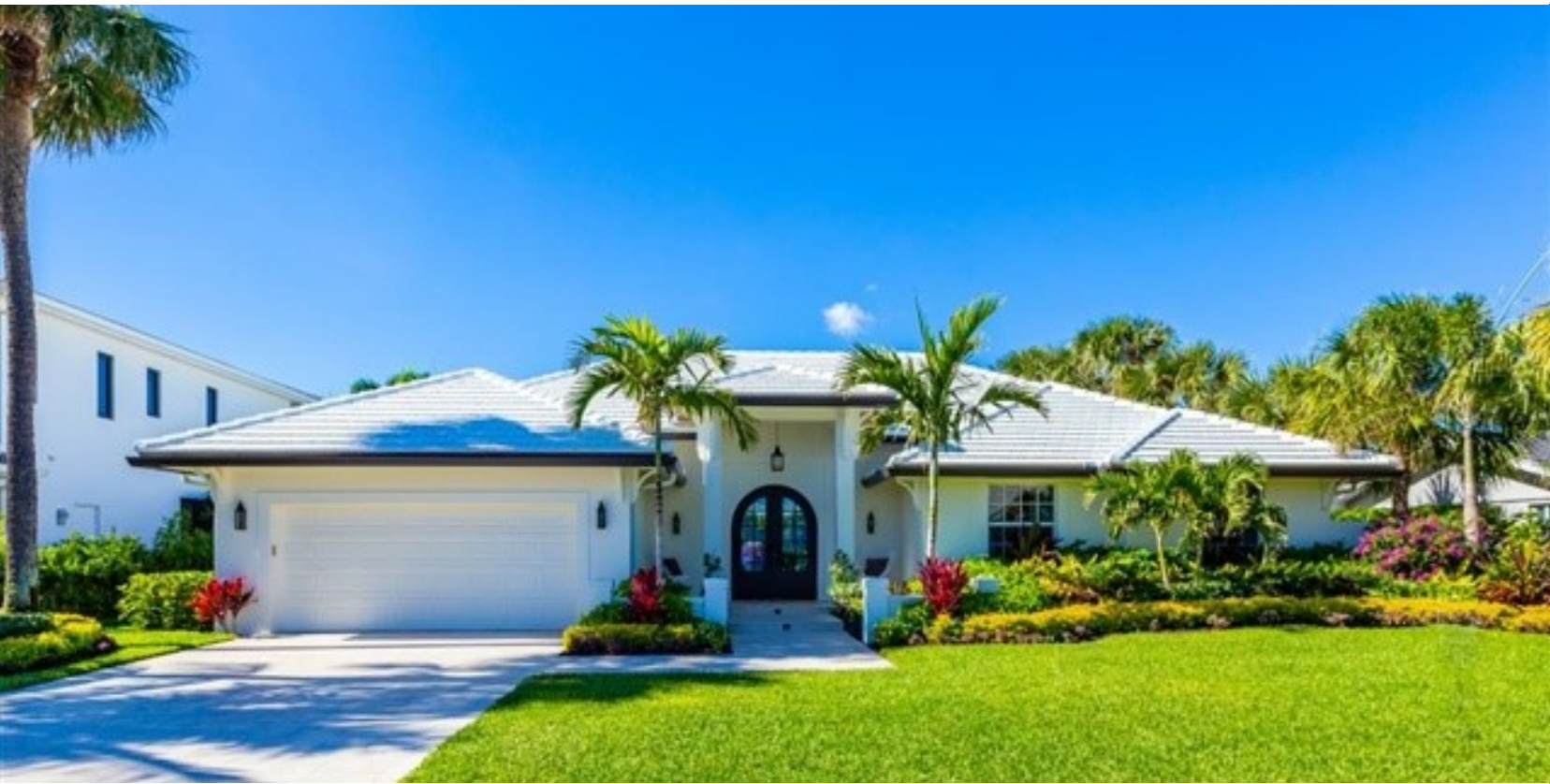
189Shelter.com | Jupiter Inlet Colony | Total Renovation | 2,654 AC sf | 4Bd.3.1Ba.2CG | $2.189M