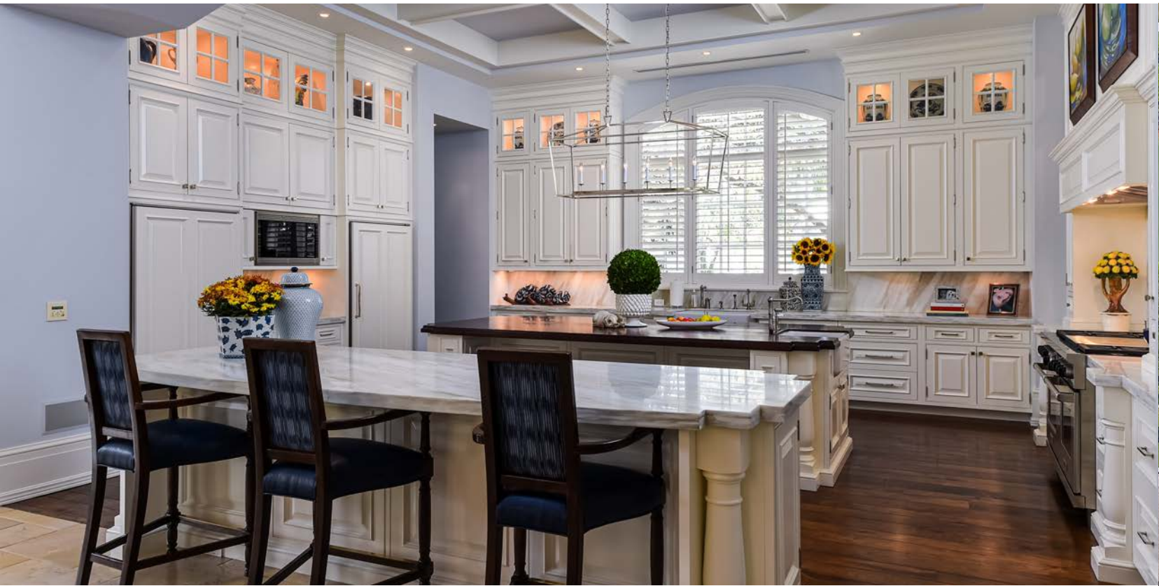
12314 Plantation Ln | Seminole Landing | Riverfront | 10,814 AC sf | 6Bd.6.2Ba.7CG | $8.9M