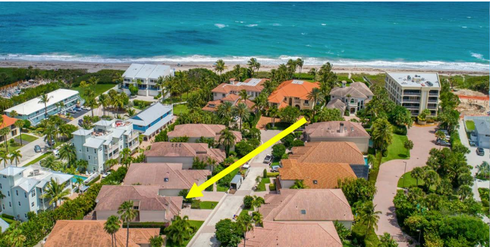
312Alicante.com | Alicante at Juno Beach | 3,191 AC sf | 5Bd.4.1Ba.2CG | $1.295M