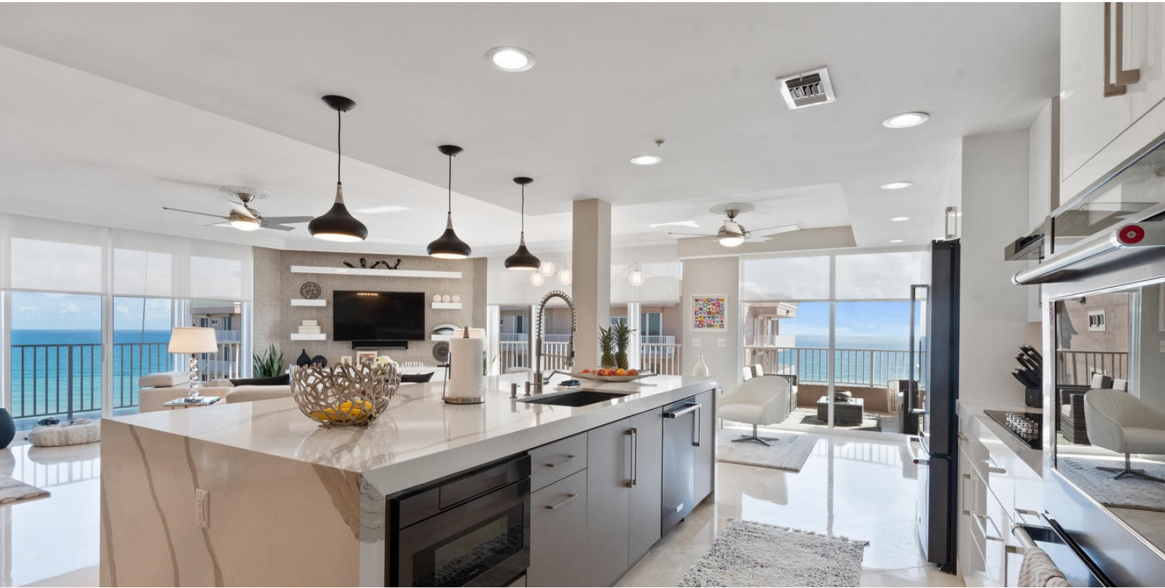
700OceanRoyalePH1.com | Ocean Royale | Oceanfront | 2,936 AC sf | 3Bd.3.1Ba.2CG | $2.295M