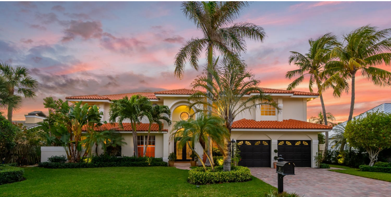
195Shelter.com | Jupiter Inlet Colony | 4,018 AC sf | 4Bd.3.1Ba.2CG | $2.395M