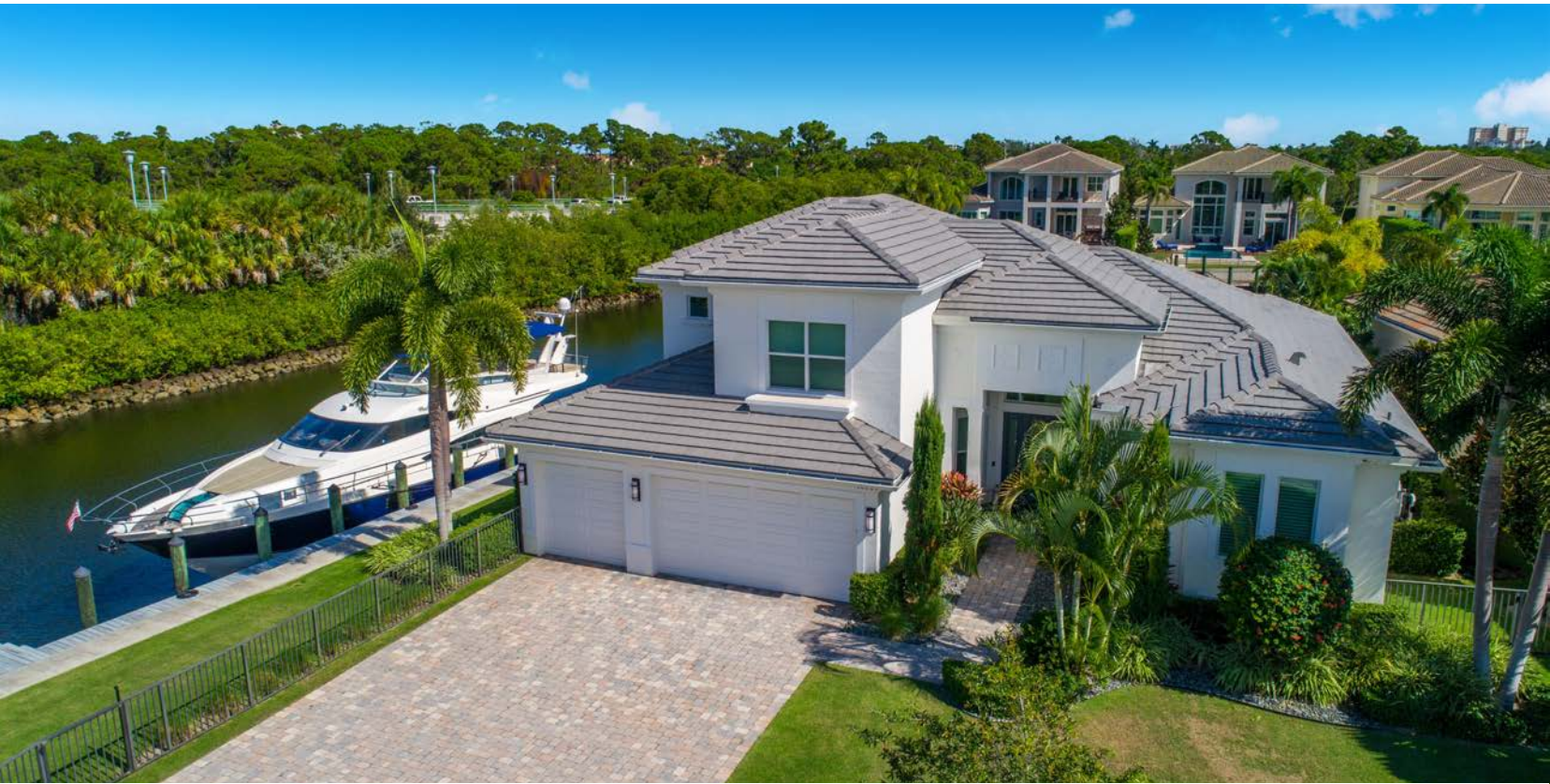
13966ChesterBay.com | Frenchman's Harbor | 4,138 AC sf | 4Bd.5.2Ba.3CG | $2.995M