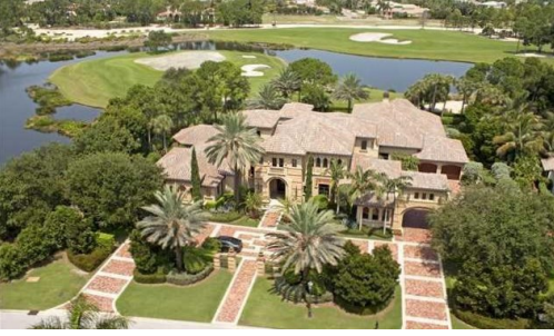
11601 Charisma | SOLD $6.15M