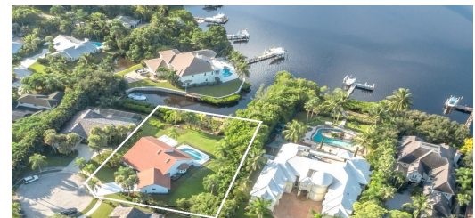
141 Pinehill Trail | SOLD $1M