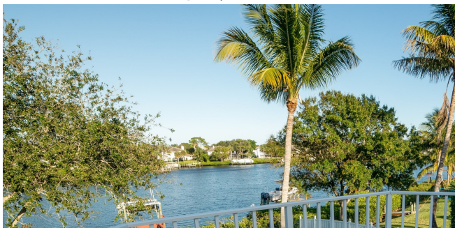
18372 SE Hermitage | SOLD $1.350K