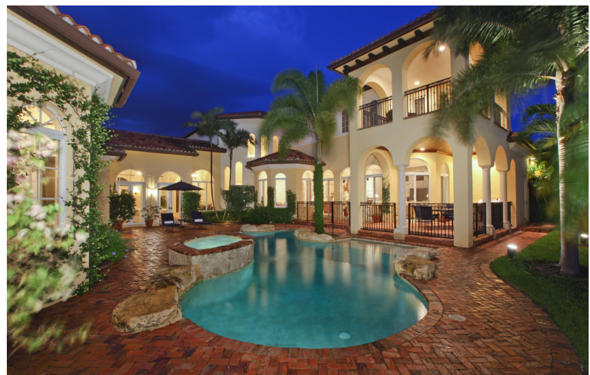
676 Hermitage | SOLD $3M