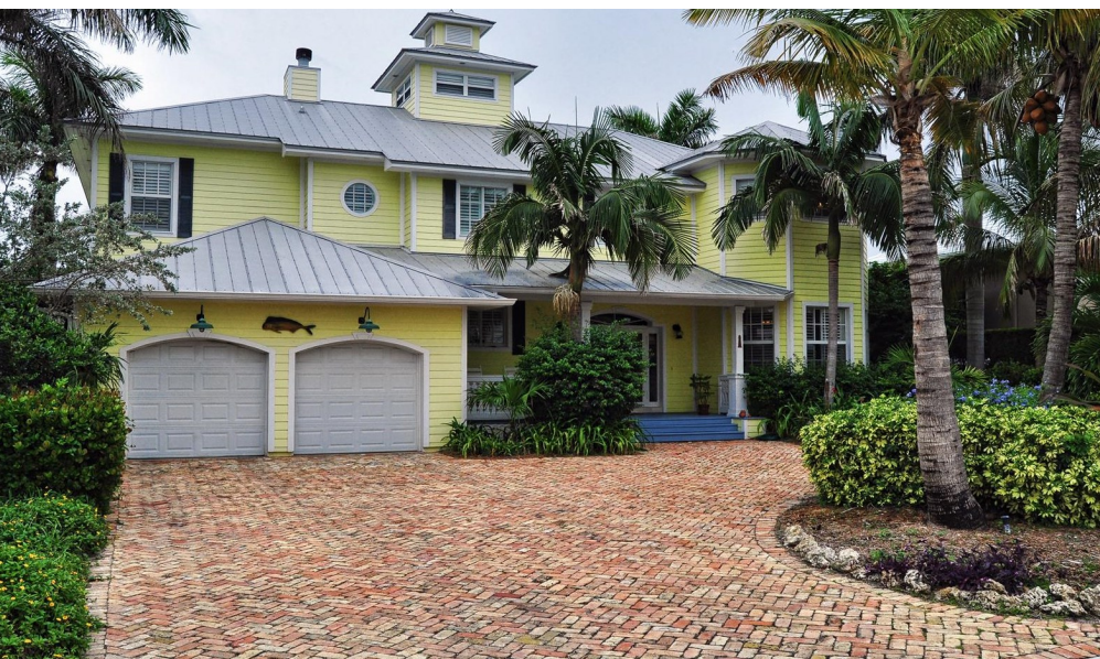
19112 Basin Ct | SOLD $1.6M