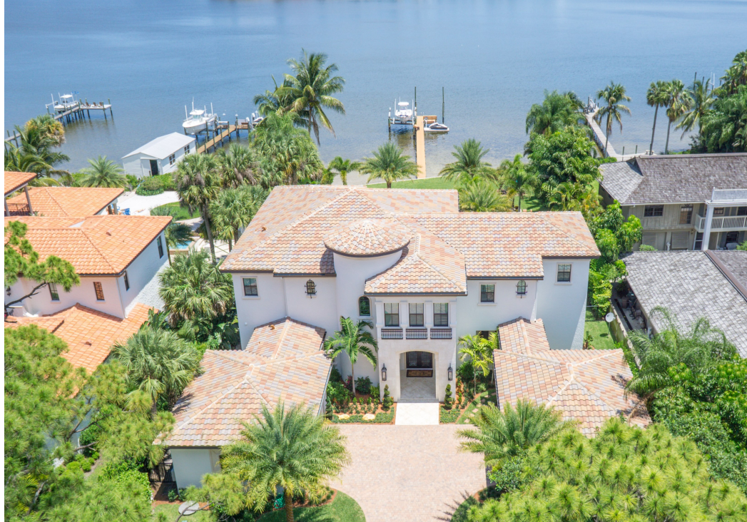
5431 Pennock Point | SOLD $5.4M