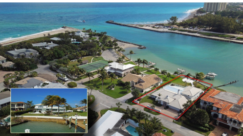
77 Lighthouse | SOLD $2.95M