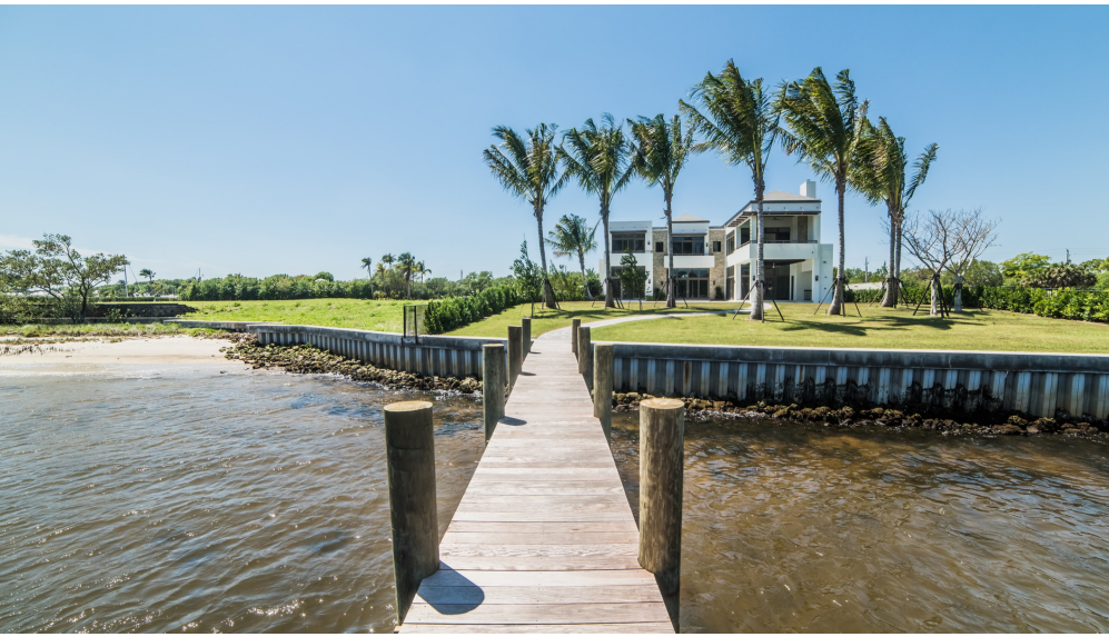
14646 Watermark Way | SOLD $4.9M