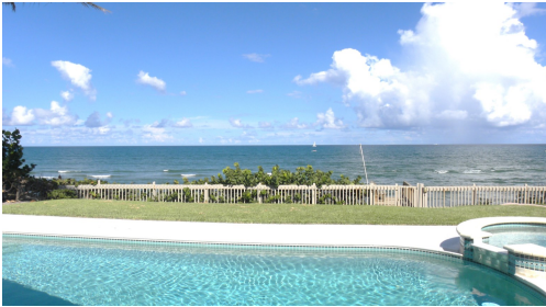
2 Ocean | SOLD $3.55M