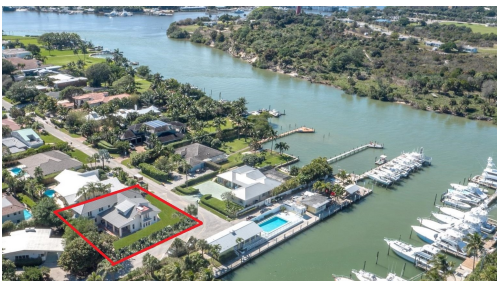
108 Lighthouse | SOLD $3M