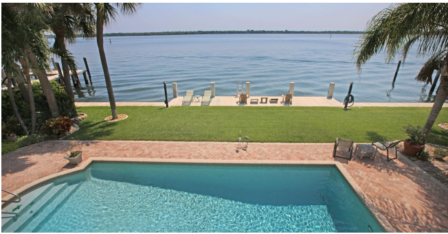
824 Lakeside | SOLD $2.2M