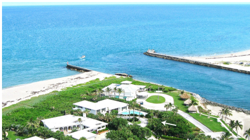
243 Ocean | SOLD $4.750M