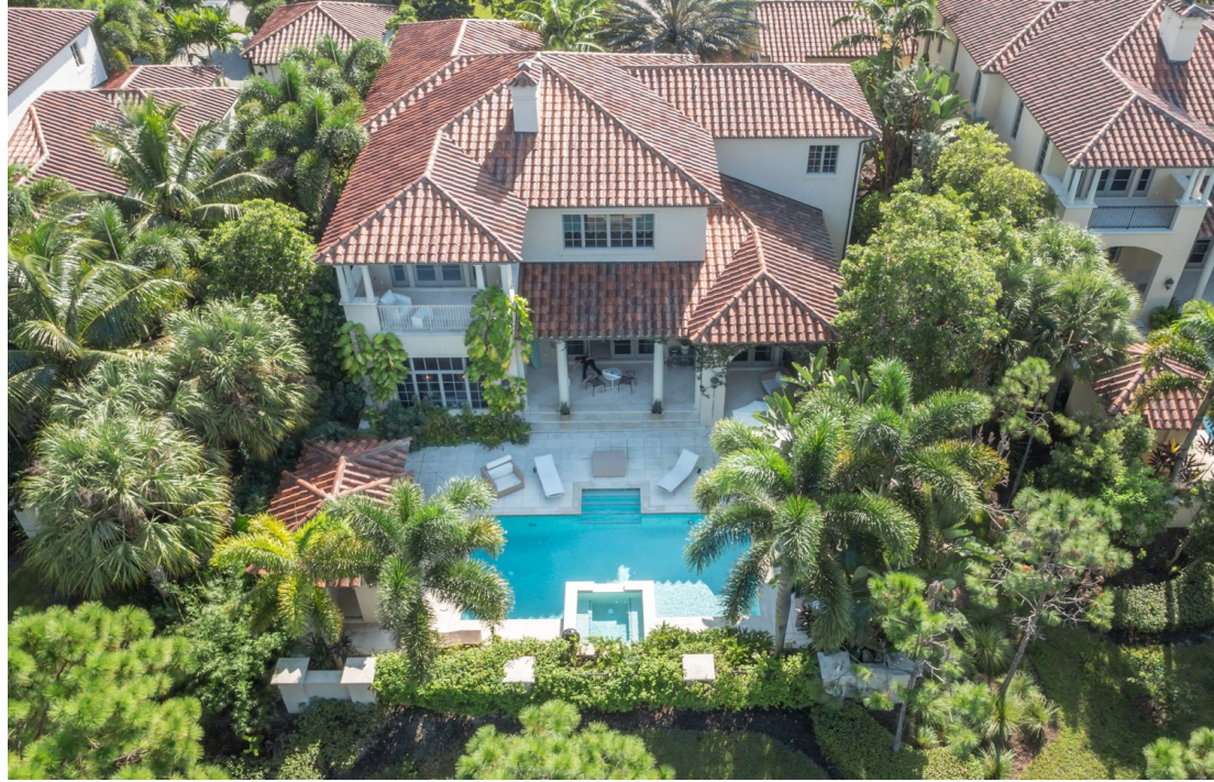
506 Bald Eagle | SOLD $2.5M