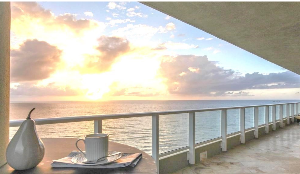
5050 N. Ocean 1701 | SOLD $2.7M