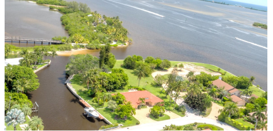
2 Island Rd | For Sale $1.2M