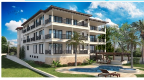
ARTIST RENDERING NEW CONSTRUCTION TO BE BUILT