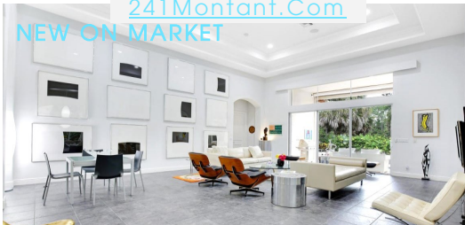
3+den / 3.1 / 2 Frenchman's Reserve $1.095M