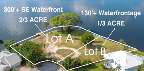
Lot A - $2.75M | Lot B - $1.895M