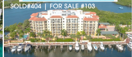
SOLD #404 | FOR SALE #103 2/2 Luxury Waterfront Condominium $995K