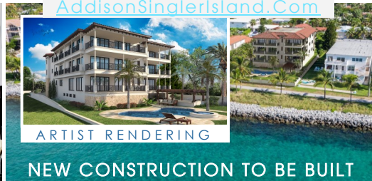
5 Boutique Waterfront Residences | $1.3 - 3.5M