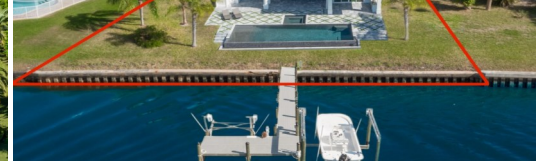
5/4.2/3 | 4,600AC Sq Ft | TCC $3.45M