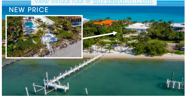
Direct Ocean & Intracoastal | 4,460 AC Sq Ft | Jupiter Island | $8.5M