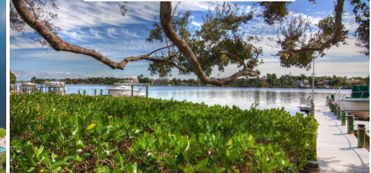
4/4.1/3 Key West Style home | Wide River $2.85M