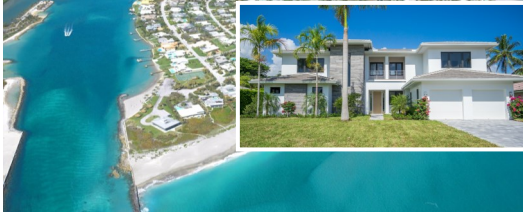
4/4/2 New Construction | Jupiter Inlet $2.8M