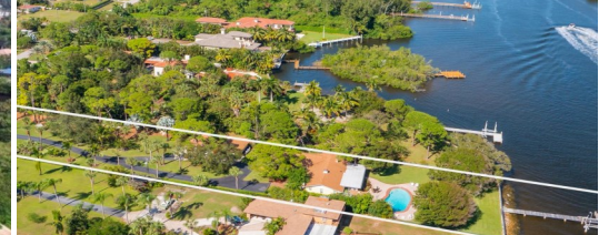
4/4/2 | 1.4Acre | Intracoastal Waterfront $2.65M