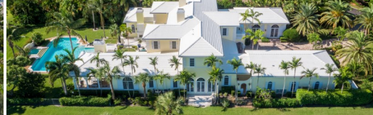
9,500 Sq Ft Ballenises Estate $4.2M