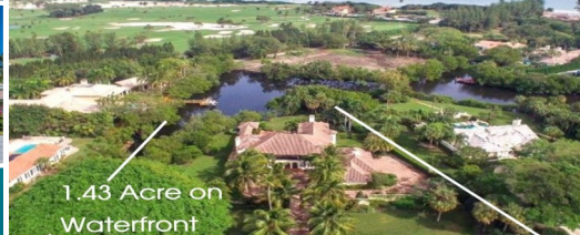
1.43 Acre on Waterfront 1.43 Acre | 5/5/3 Waterfront home $3.05M