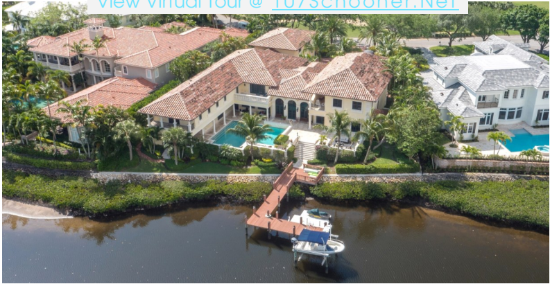
Magnificent Mediterranean | 11,178AC Sq Ft Estate | Admiral's Cove | $7.75M