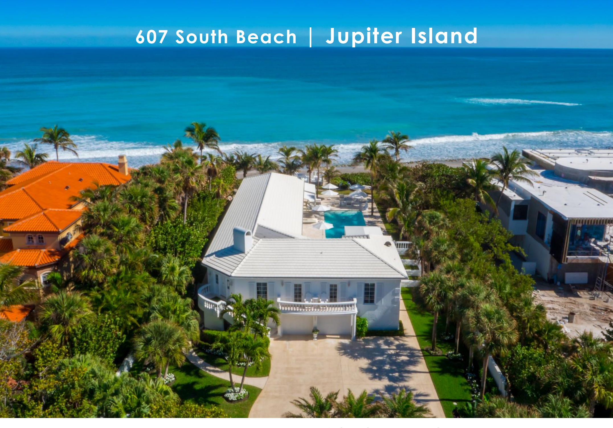
VIEW VIRTUAL TOUR @ 6078Beach.com